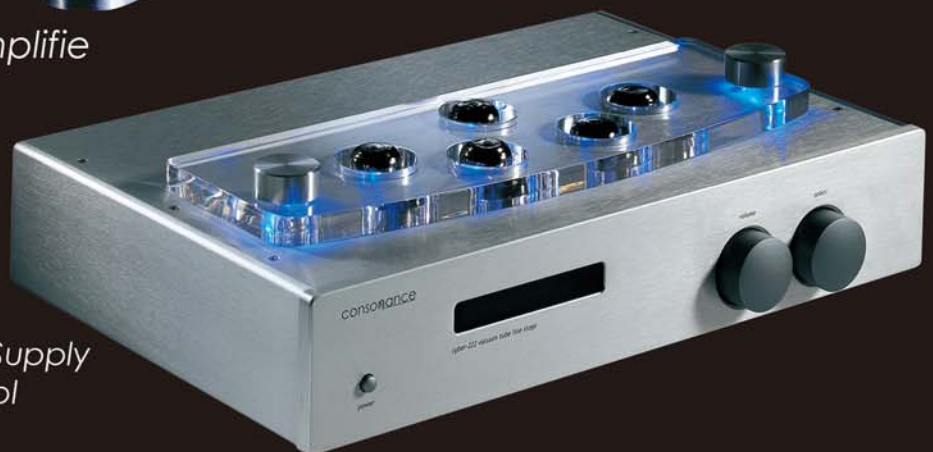
Cyber - 222 MKII pre amplifier class A Separated Power Supply relay based volume control LED display