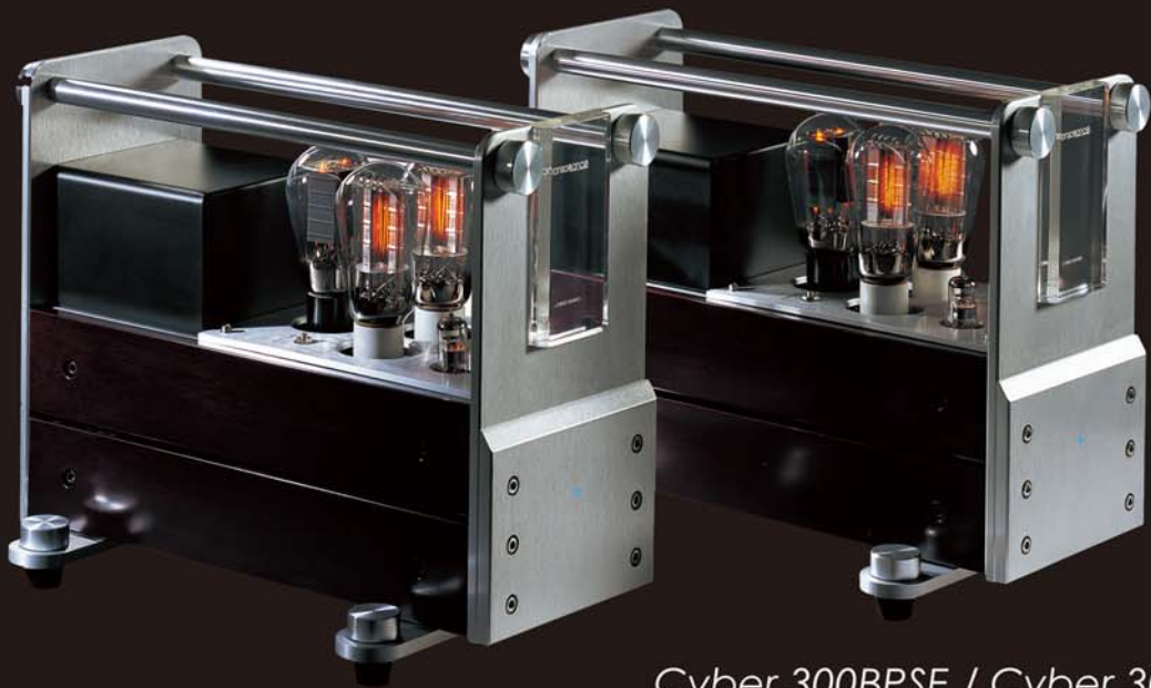
Cyber 300BPSE / Cyber 300BD single ended in parallel / push-pull